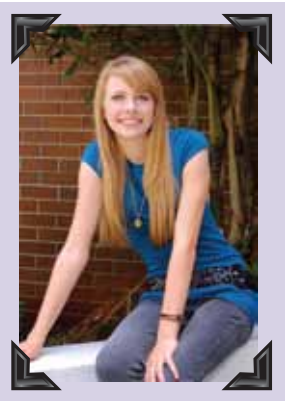
"At first I was skeptical about attending The College Academy, but now that I have made so many new friends and have taken college level classes, I'm glad I accepted this exciting challenge!"