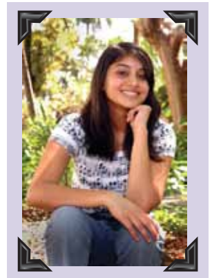
"I decided to attend The College Academy after I witnessed how it helped my sister expand her academic opportunities and grow to become a more confident person."