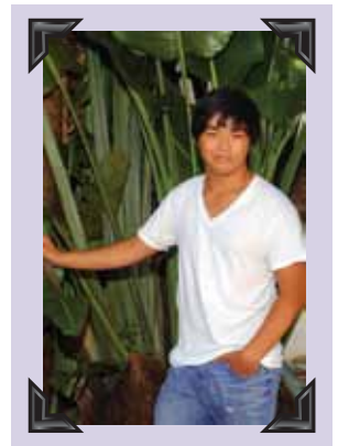
"At The College Academy, the teachers take a genuine interest in the students and obviously enjoy teaching."