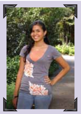
"The College Academy is providing me a perfect opportunity to pursue my academic dreams."