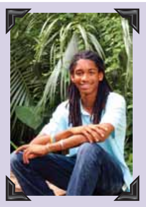
"Despite my initial uncertainty, The College Academy, by far, has been one of the best and most advantageous decisions of my life."